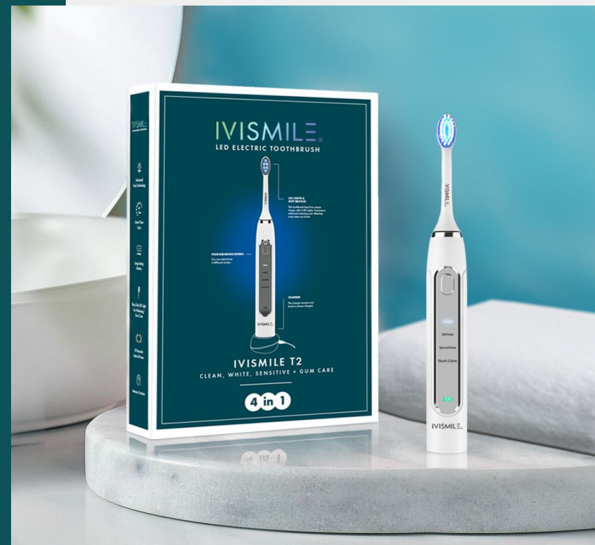
LED Power e-toothbrush (Rechargeable, Smart timer & Wireless)