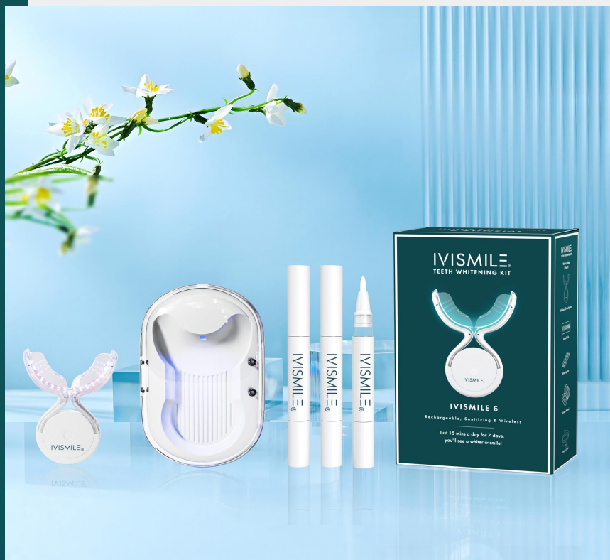
IVISMILE 6 (Gen 6 - Rechargeable, self sanitizing & Wireless)